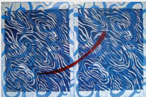
Fresh, woodcut with monoprint, 21.5” x 12”