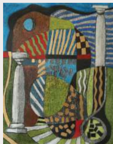
Odyssey, carborundum intaglio, hand coloring, 24 k gold leaf, 10” x 8”

Cover image: Shui, China ink painting with digital print, 24” X 20”.