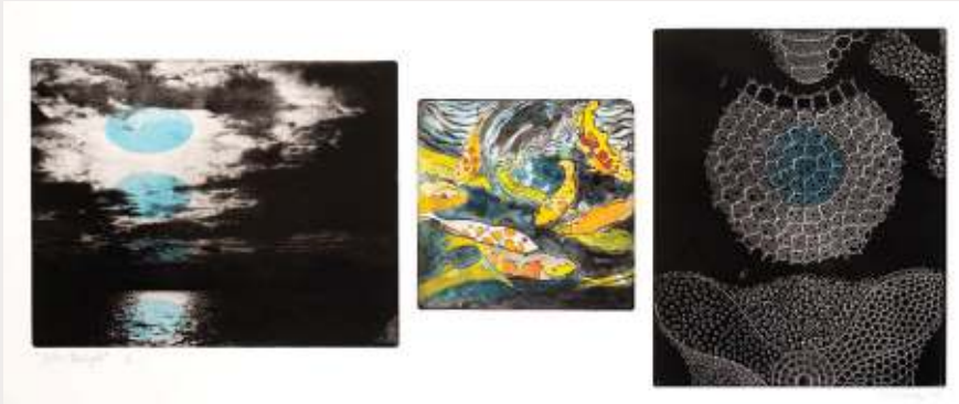
Celtic Twilight, intaglio, hand coloring, 10" x 24"

Artist Books, aligned to the printmaker's art, present the viewer with many surprises in their myriad forms. They are portable, can be held in a (gloved) hand and examined at close range, without the traditional glazed framing of other original art. Some binding styles are Concertina, Flag, Single (or Double) Signature, and Drum Leaf. They originated as a contemporary art form in the 1960s, but they have a centuries long history to inform them, originating with Clay Tablets and Papyrus Scrolls. Artist Books may be editioned or one-off, and they are archived by art museums and private collectors. Many universities have Book Arts departments.