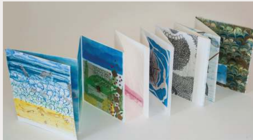
Surf, Intaglio, Lithograph, Collagraph, 9" x 8.5" x 102"