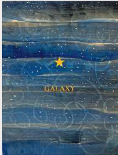
Galaxy, 9.75" x 7.5"