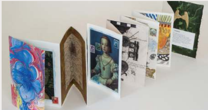
The Journey, Intaglio, gold leaf, hand coloring, 8.25" x 5.75" x 66"