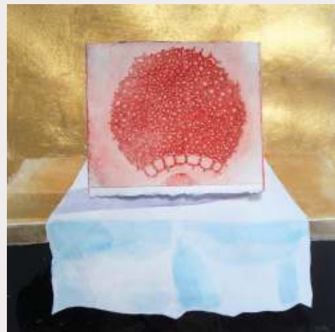
Celestial Feast, intaglio, china ink, 24k gold leaf, 14” x 14”

Cover image: Shui, China ink painting with digital print, 24” X 20”.