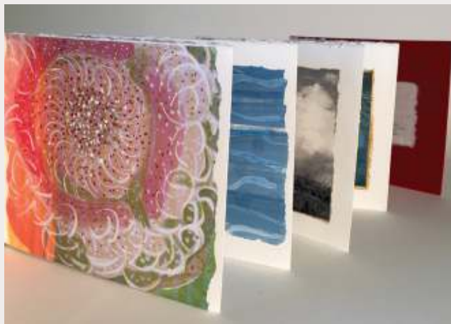
Odyssey, intaglio, digital prints, hand painting, 8"x 9.75" x 114"